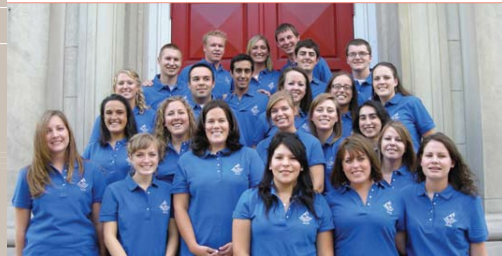
AUGUSTINIAN VOLUNTEERS, 2008-09.