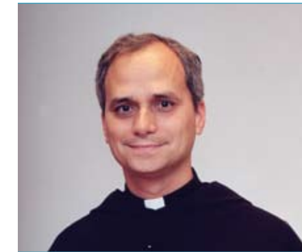
PRIOR GENERAL ROBERT PREVOST, O.S.A.

toward greater collaboration, sharing of resources and personnel, and even structural reconfigurations among groups of Augustinians. For example in Italy, where there were previously seven provinces, they gradually worked to unite into one. The Provinces of the Netherlands and Belgium will soon merge into one Province. In Brazil there is now a federation of three circumscriptions (two vicariates and one delegation) that had originally been established as missions of three different provinces in Europe. They have already decided to request becoming a new Province in the next Ordinary General Chapter. The conversation