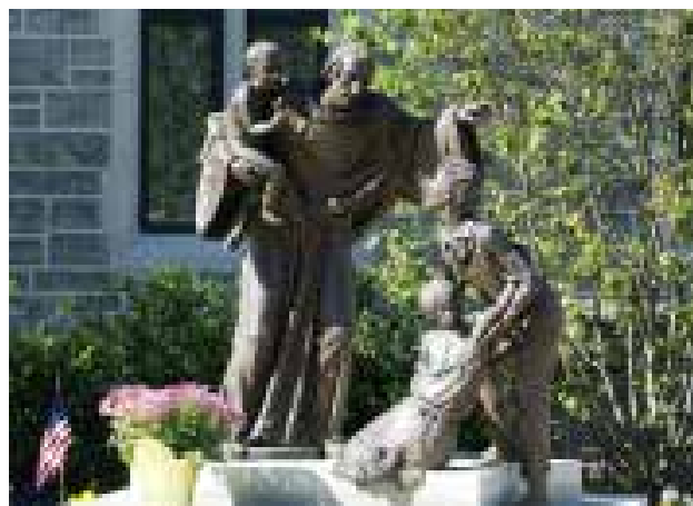
Statue of St. Thomas of Villanova with the poor, outside the Monastery at Villanova.