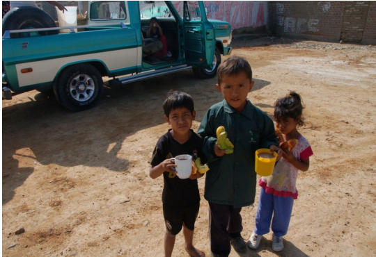
Children in Peru receiving food on the Feast of St. Martin de Porres, a Peruvian Saint.

Each year in the parish of Pacasmayo, Peru, a mission of the American Augustinian Provinces, there is a weeklong liturgical celebration to mark the feast of St. Martin de Porres. In Pacasmayo the feast is always celebrated on the third Sunday of November, not on the date that appears in the universal calendar (for reasons of local custom). One of the important events is always the special breakfast