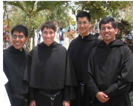
Formation Students in Peru

In Peru the majority of friars serving are now native Peruvians. This year the Vicariate of Chulucanas, Peru, which is a part of the American Augustinian Provinces, has a total of 38 young Peruvian men preparing for the Augustinian life. In the entire country of Peru there are over 60 Peruvian men in various levels of the formation program.